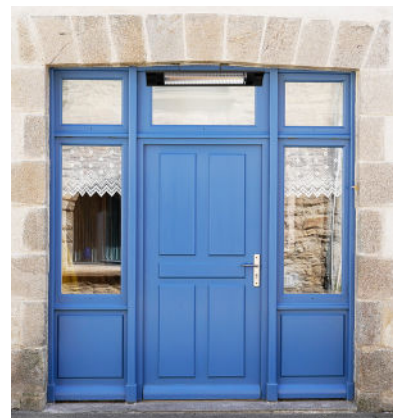
CEILING MOUNT (PH1500)