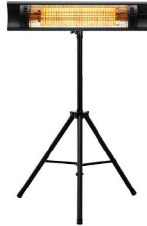
FREE STANDING (PH1500K)